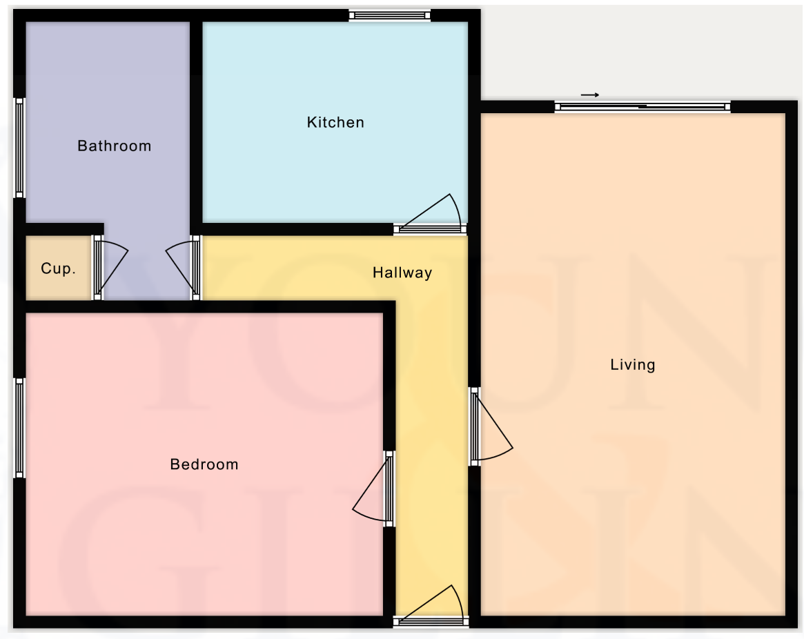
Not to scale. This floor plan is intended to give a general indication of the layout only.